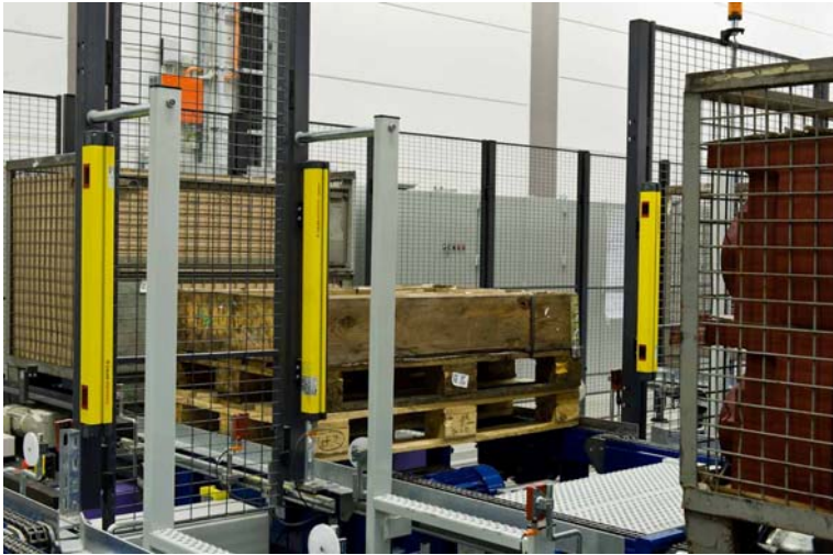
Transfer of Euro pallets