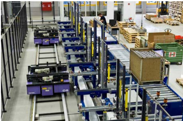
Transfer stations in an overview with STV and loading device