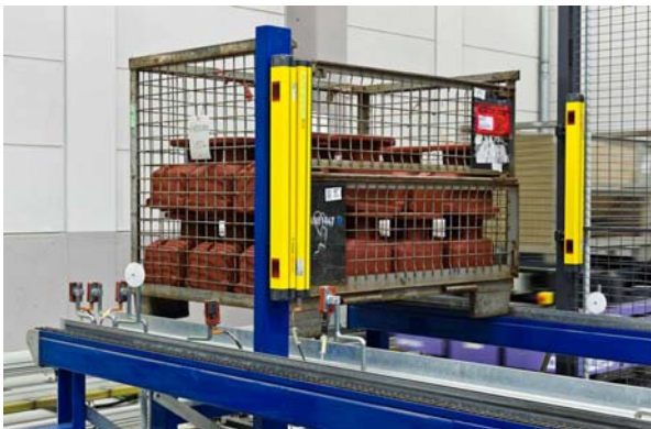
Transfer of wire-mesh boxes