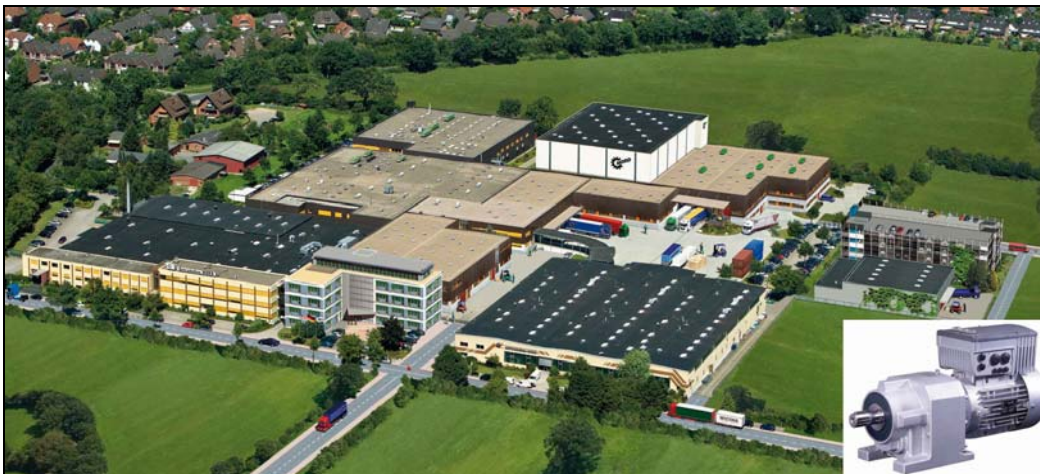
NORD DRIVESYSTEMS in Bargteheide, Germany

By means of the monitored and time-limited suppression of protective functions, the productivity of automated systems can be increased significantly. With the muting technology developed by Leuze electronic for the AS-i Safety Monitor, this can now easily be achieved with AS-Interface Safety at Work up to category 4 acc. to EN 954-1 or PI e acc. to EN ISO 13849-1. This is clearly demonstrated in an application at “Getriebebau NORD” (NORD DRIVESYSTEMS), realized by system manufacturer Daifuku in collaboration with UCS and Leuze electronic.