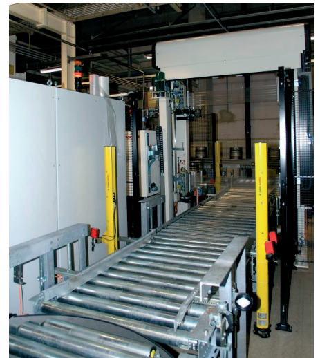
Fig. 2: Aetna systems for stretch wrapping and paper banding palettes

specific solution, Leuze provides the proof of its high standard of flexibility in supporting its customers. The system is now available in the standard range and can therefore also be supplied to customers with similar requirements to Aetna's.