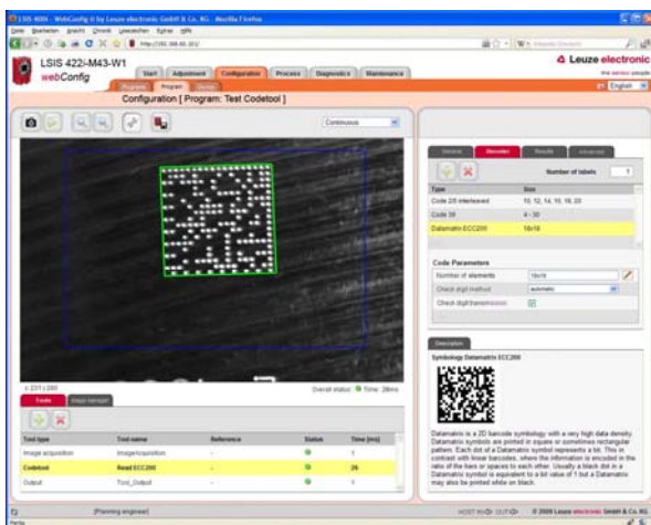
Fig. 1: The image of a Data Matrix code can be seen on the webConfig user interface