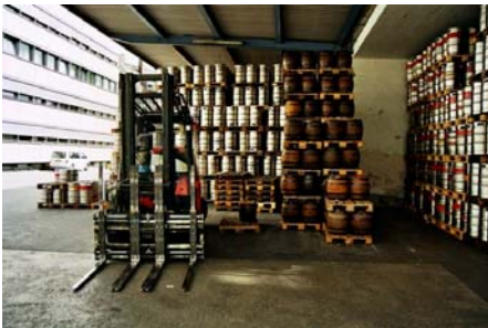
Pic. 1: Beer from wooden barrels still has plenty of customers today. The well-thought through automation concepts of tradition-conscious breweries incorporate this aspect.

In per capita beer consumption Bavaria has a considerable lead over Germany's other federal states, which might possibly be down to the Bavarian propensity to consume in general, but definitely has something to do with the exceptional quality of