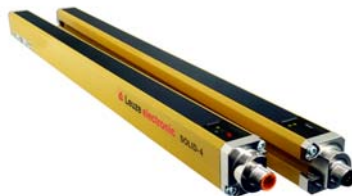
Pic. 5: SOLID-4E Safety Light Curtains ensure the highest possible system availability with their extremely warp-resistant and interference-proof construction.

All factors combined, this type 4 safety light curtain in accordance with IEC/EN 61496 enables a flexible, reliable and costs-optimized overall safety solution in this highly stressed environment. If the process stops because the operator activates the SOLID-4E Safety Light Curtain with an unpermitted penetration of the 20 mm resolution protective field, the system's PLC assumes the automatic restart – an important function, which can also be executed as required with the light curtains straightforward functions selection.