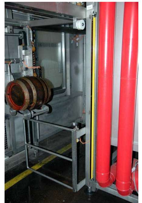
Pic. 6: Guarding with SOLID-4E Safety Light Curtains allows the barrel to be safely removed at the system exit after cleaning.

The two-beam system over several meters prevents anybody from getting too close to the roll conveyor and being injured. ROBUST light beam safety devices are also used for guarding feed-in areas with pallet transport (picture 7). This safety solution prevents people from entering the transport route and being injured by moving pallets. The multiple beam ROBUST safety system features the IP 67 protection