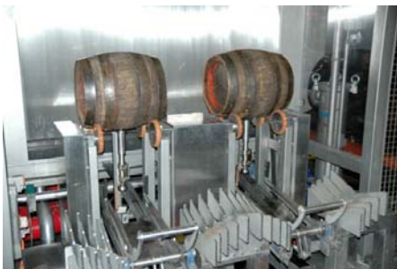
Pic. 4: Once a barrel is on the grippers, the cleaning process runs fully automatic at the push of a button.

system concepts, and also provide effective personnel protection in accordance with international safety standards, without hampering workflows in the process. These