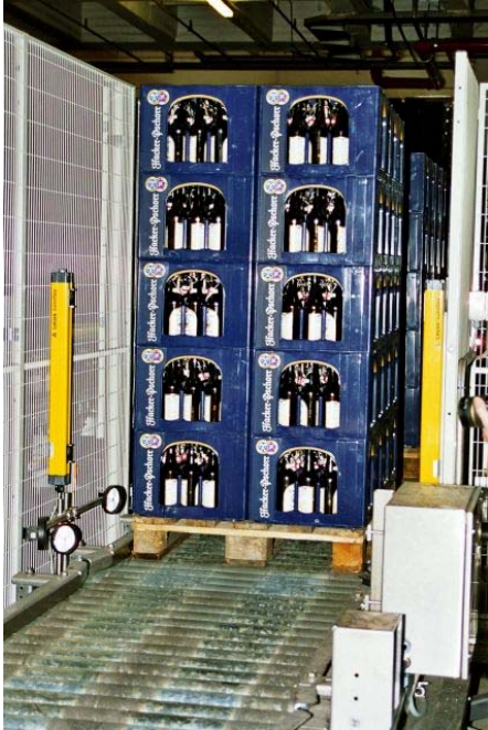
Fig. 7: With pallet transporting ROBUST Multiple Light Beam Safety Devices provide reliable safety on conveyor lines.

addition to muting transceivers, also includes a pre-installed “Muting Mounting System (MMS)” for easy and flexible mounting of muting