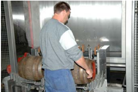
Pic. 3: Guarding with integrated SOLID-E Safety Light Curtains means the operator is no danger when feeding the wooden barrels.

Paulaner has opted for Leuze lumiflex safety sensors in ensuring the operator is never injured by the movement of the gripper. Based in Fürstenfeldbruck near Munich, this safety specialist company produces safety sensors and evaluation devices that enable a cost-effective integration into various machine and